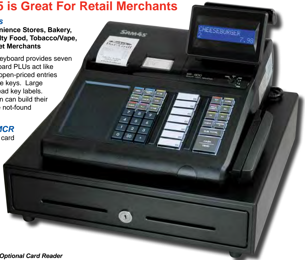
SAM4s ER-915 Shown With Optional Card Reader

Use the optional integrated card reader to swipe payment cards when integrated payment options are implemented.